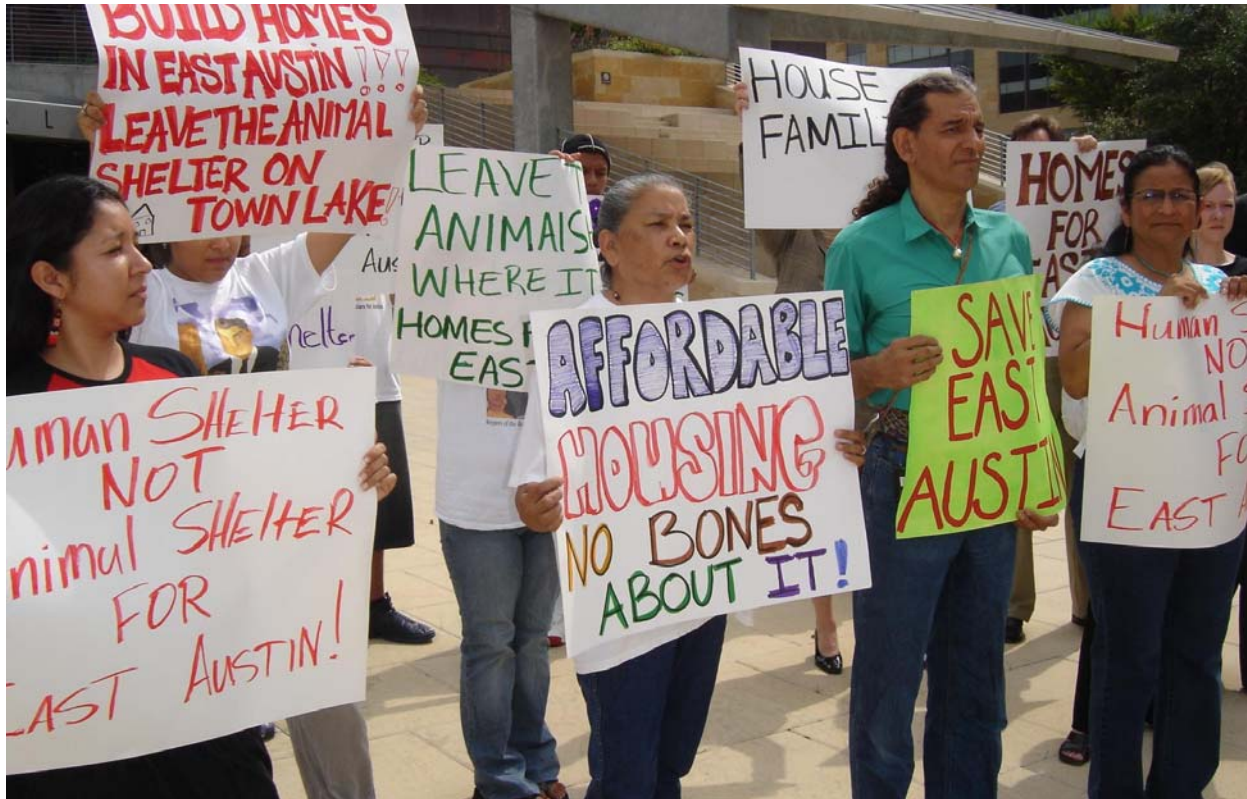
table and thus, the impacts on these communities did not receive meaningful consideration. Urban planners and developers began developing the urban core as if people of color were not living in them. New zoning codes and policies were adopted to make room for the new urbanism. Communities of color throughout the United States began to see condos, lofts, McMansions, and live/work buildings pop up in low-income and people of color neighborhoods. A tidal wave of gentrification began to engulf people of color communities.