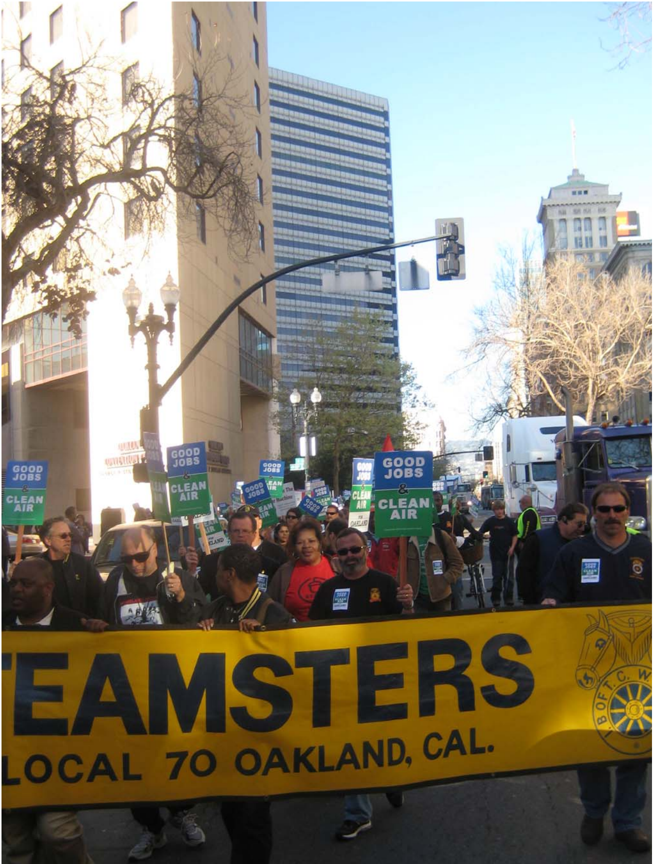
■ Photo: Union and community members unite for clean air and good jobs at a demonstration in downtown Oakland.