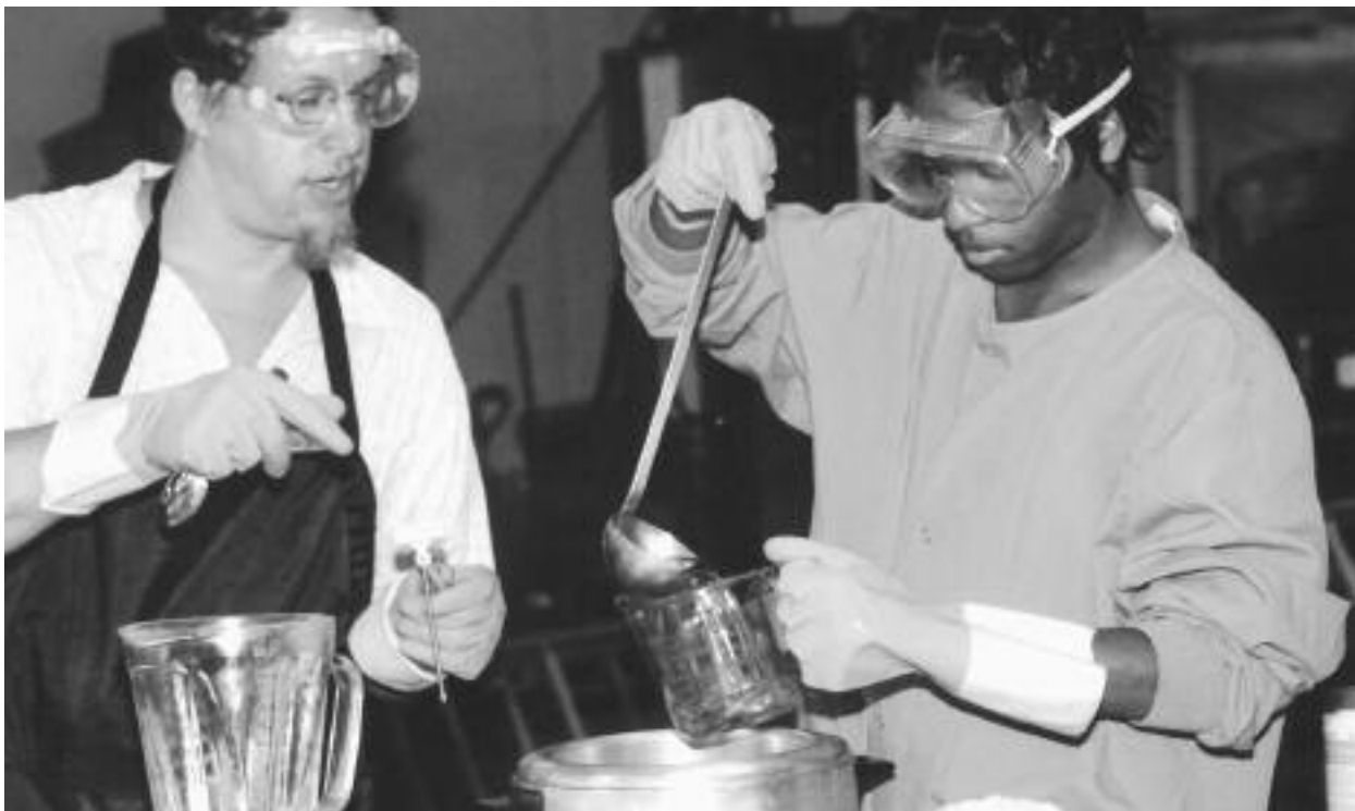
Photo: Youth Policy Institute students make biodiesel.

The Youth Policy Institute Class of 2005 worked on two different projects: dirty diesel exhaust and a community festival to promote and celebrate environ-