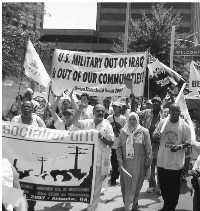
Photo: Forum participants stage march through downtown Atlanta.

The forum process was centered on the workshop exchange. Over 1000 workshops were presented, almost all by forum registrants who also attended other folks' workshops. Every major theme in today's social movements was represented, from immigrant rights to gender liberation. Trainings in media making, messaging, organizing basics, economic analysis, undoing racism, healthcare access, reparations—the list is exhaustive. Were this massive