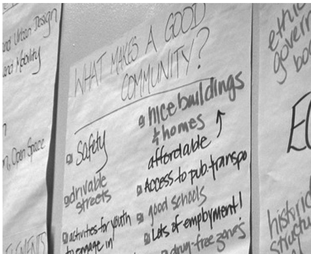
Richmond residents answer the question “What makes a good community?”

3) Richmond Grows in People and Diversity. While many historically industrial cities in the U.S. face ongoing population loss, Richmond is a growing city of close to 100,000 people, with a diverse resident population and workforce.