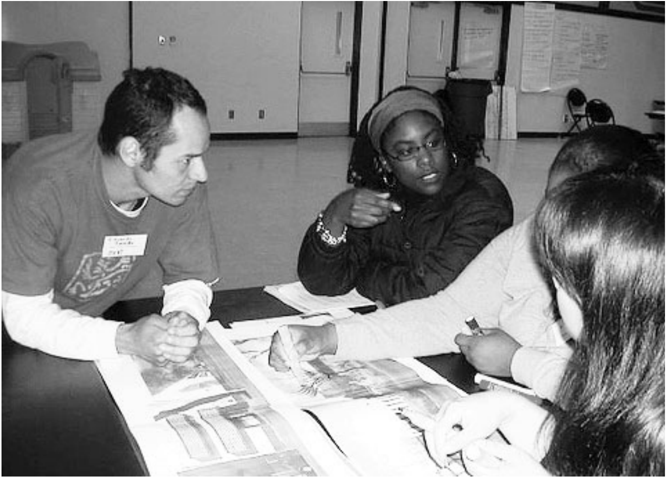
Participants in the Richmond Regional Equitable Development Initiative Grassroots Leadership Institute workshop discuss a vision for filling empty lots in Richmond.

T he City of Richmond is on the brink of incredible change. The city’s increasingly diverse population and workforce—along with new job growth—represent trends that can help renew both the city’s pride and purpose. With the city facing near-unprecedented levels of real estate development and industrial restructuring, Richmond’s assets—including increasingly valuable land and brownfields, a large business base, easily accessible BART, train, freeway, and waterway transportation, a beautiful shoreline, and a diverse workforce—represent opportunities to further Richmond’s economic development while ensuring that all residents share in the economy’s benefits.