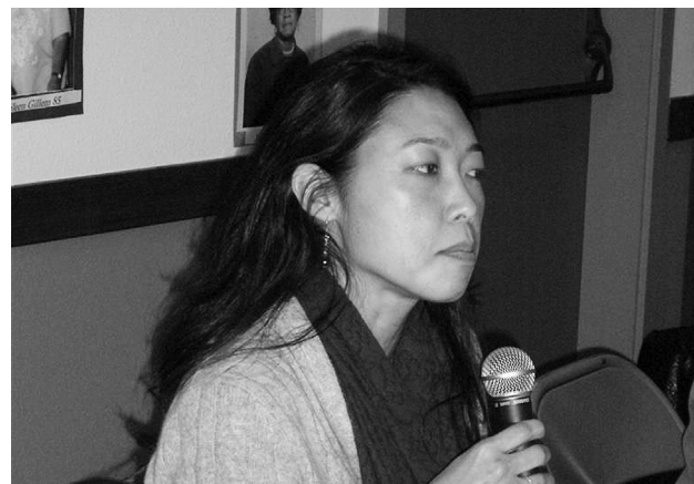
A participant speaks at the Southeast Asian Organizing Gathering of the Richmond Laotian Organizing Project of APEN in October 2006.