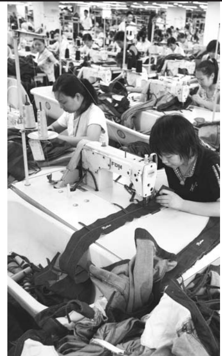
Photo: Workers sewing blue jeans in garment factory in the city of Shenzhen, one of China's first Special Economic Zones.